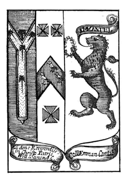
EX LIBRIS OF ARCHBISHOP SANCROFT.